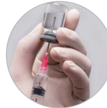
Blunt-Fill Needle for use with vials